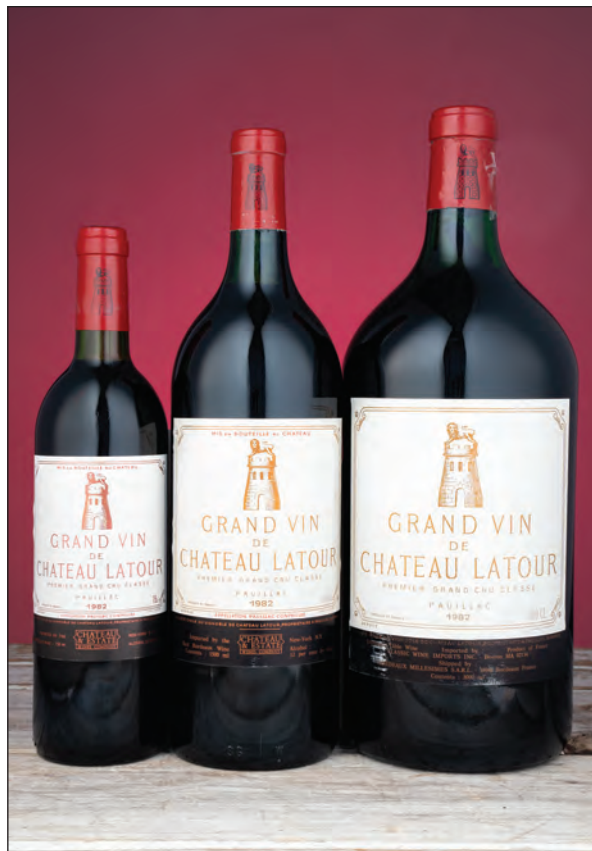
Lots 1654, 1655, 1656

1656 1 double-magnum (3L) per lot $5000-7500