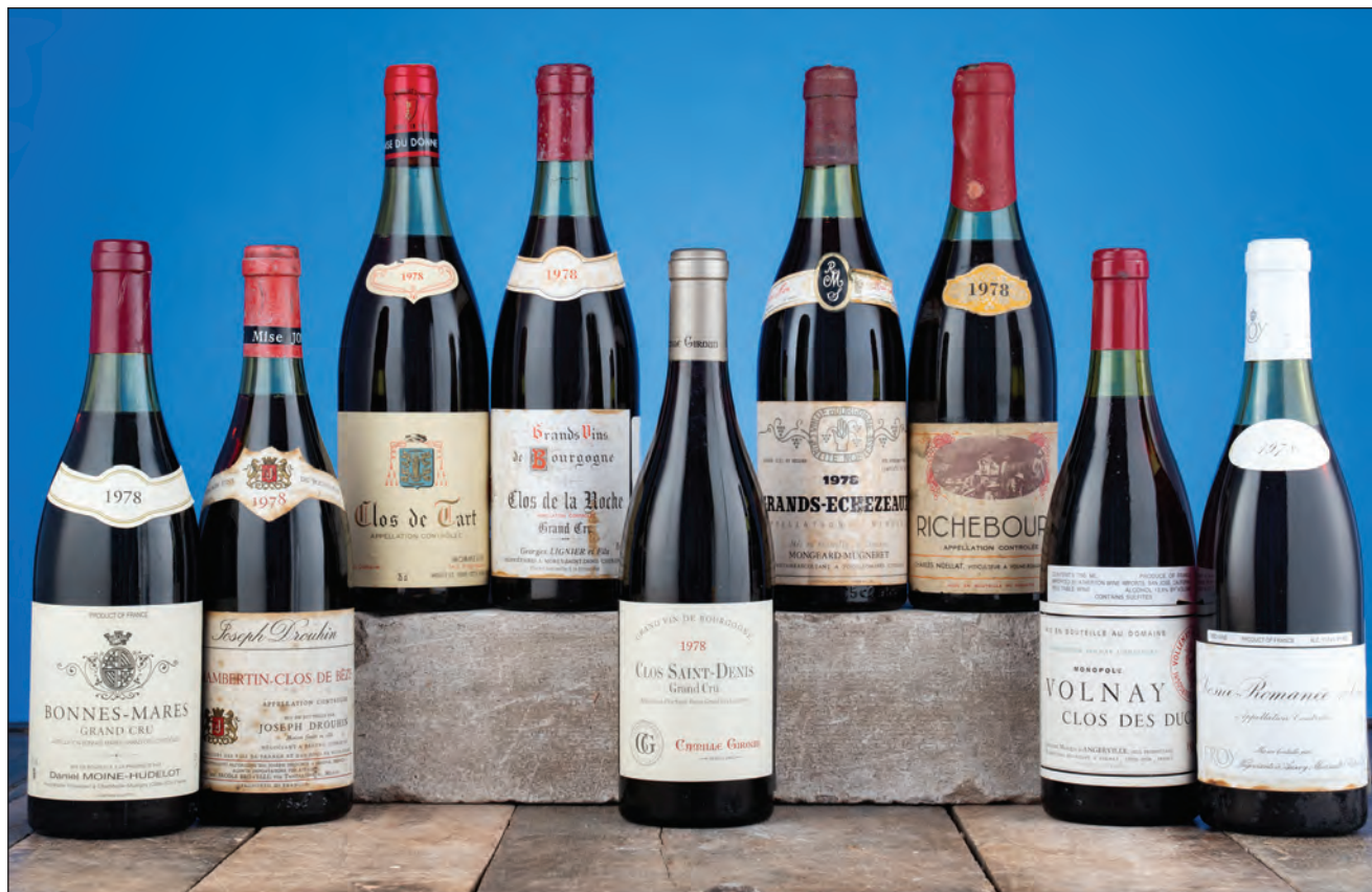
Lots 161, 267, 352, 354, 356, 397, 398

1er cru 2015 (3) 1er cru 2016 (1) 2018 (3)